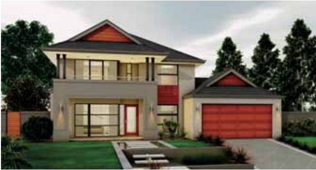
The Esplanade Classic

Don Russell Homes provide alternative elevation options that can be incorporated into the Esplanade design.