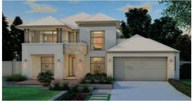
The Esplanade Coastal

Learn direct, a little more about The Esplanade Home's unique features.